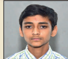
Misson Sojitra XI - A, U-17